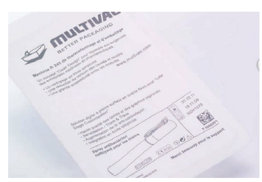
Medical Device package with Tyvek® lidding