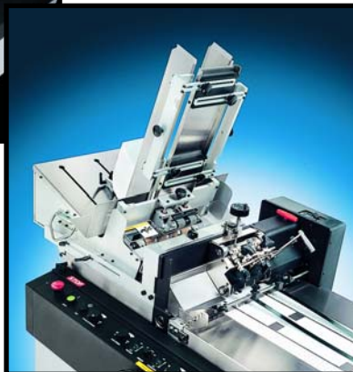
High performance feeder option

Quick setup takes only a few minutes for each media, enabling your operator to set up, modify and run jobs faster. The Model 7000 base includes performance-enhancing advances like independent feeder speed and transport controls, plus automatic gap control to increase speed and maintain media space with minimal effort.