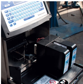
Smart Cartridge™ fluid delivery system in the Videojet 1710 coder

“When you combine our high production speeds, hot temperatures and factory environmental conditions, you need tough inks—and a printer that won't clog up when you run them,” Ju ChaoRong explains. “We've found this with Videojet. We can run any ink we need—including pigmented, high-contrast ink—in the 1710 coders without problem. And the ink dries very quickly with excellent adhesion, supporting our fast production speed.”