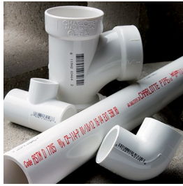
Continuous inkjet codes

Videojet coding solutions are designed to help manufacturers print the highest quality codes while maximizing efficiency and minimizing unexpected downtime.