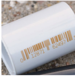
Laser code (color change)

Printed codes and marks are often the most visible indicator of your brand values and product quality. The legibility and appearance of logos, production and time stamps, bar codes and other marks can all contribute to perceived quality.