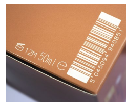
Laser bar code on carton

Large character marking (LCM) on cases. Large character ink jet printing is a cost-effective way to customize standard corrugate shipping cases. These systems can replace or customize your pre-printed shipping cases making them retail ready with product pictures, bar codes, logos and shipping information. Customized cases help enhance efficiency in your supply chain and allow adding software systems which track your product through the distribution channel.