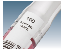
TTO code printed directly onto lip gloss label