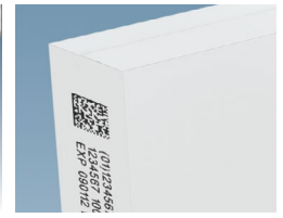
TIJ 2D bar code on paper carton