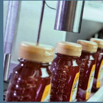
Videojet 1510 printing on-line

Dutch Gold Honey continues to see more and more coding requirements every year and is able to meet customers’ needs as they change. The CLARISUITE system allows them to expand and gives them the comfort to know that all the information is correct and will meet their customers’ needs.