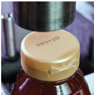
Ink jet code on top of plastic bottle