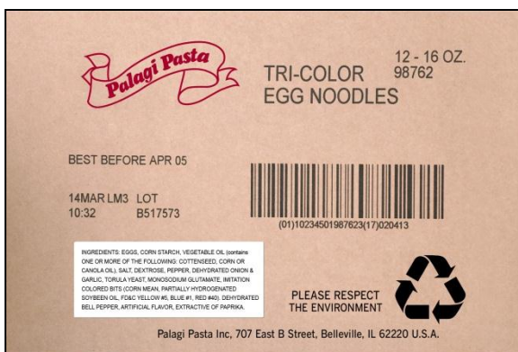
Pre-printed logos and company data. Label with ingredient listing. Product information printed in-line with ink jet printer.