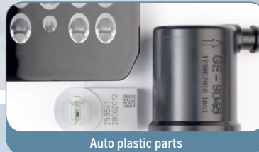
Auto plastic parts