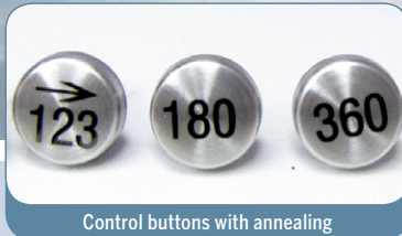
Control buttons with annealing