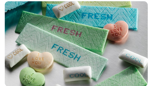
Food and Confectionery